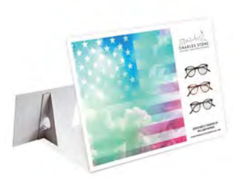
A5 FADED FLAG STRUT SHOWCARD