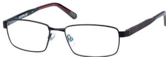
CTO-NEEDLE-004 Matte black