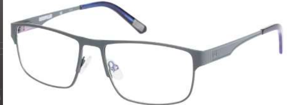
CTO-BILLET-005 Rubberized matte gun