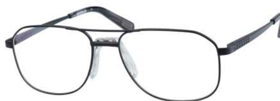
CTO-ZONER-004 Matte black