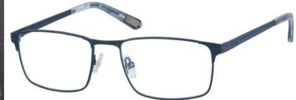
CTO-GAFFER-006 Rubberized matte navy