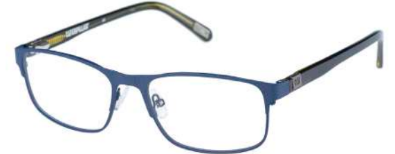
CTO-CONTRACTOR-006 Rubberized matte navy