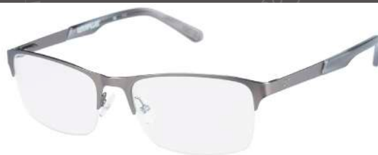
CTO-ESTIMATOR-005 Shiny gun / Solid smoke