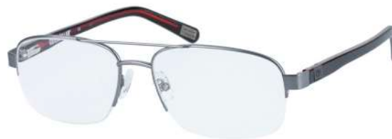
CTO-GLAZER-005 Matte gun