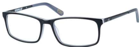
CTO-SCHEDULER-104 Gloss black