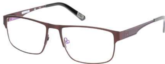
CTO-BILLET-003 Rubberized matte brown