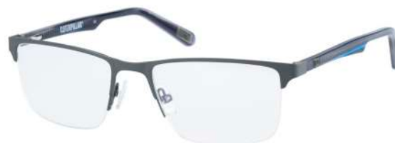
CTO-GAMBREL-005 Matte gray