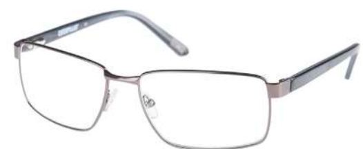
CTO-RIVETER-005 Matte gun