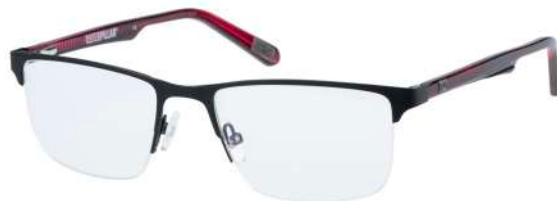
CTO-GAMBREL-004 Matte rubberized black