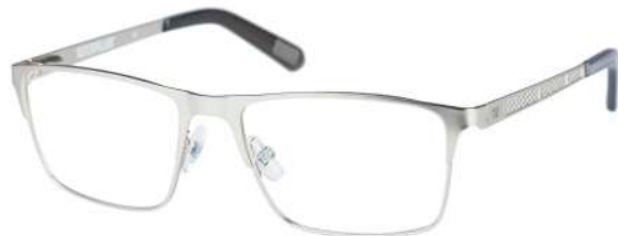
CTO-FITTER-002 Matte silver