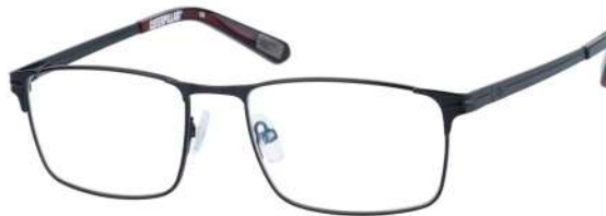
CTO-GAFFER-004 Matte black