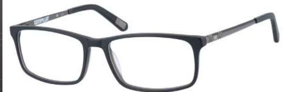
CTO-SCHEDULER-127 Matte carbon