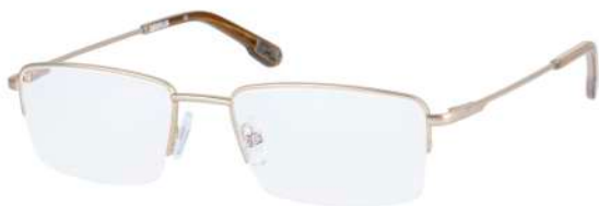
CTO-TINKER-001 Matte gold