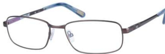
CTO-SETTER-010 Matte titanium