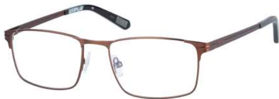
CTO-GAFFER-003 Matte brown