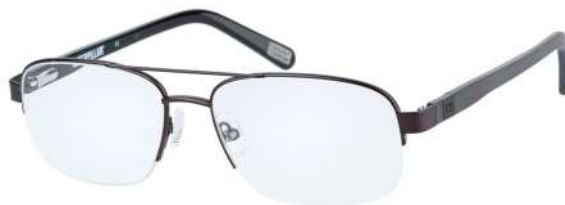
CTO-GLAZER-003 Matte brown