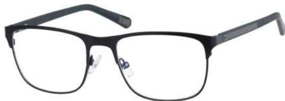
CTO-PADSTONE-004 Matte rubberized black