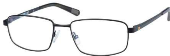
CTO-DENTILS-004 Matte black