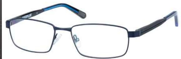
CTO-NEEDLE-006 Matte navy