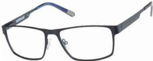
CTO-TWINTHREAD-004 Rubberized matte black