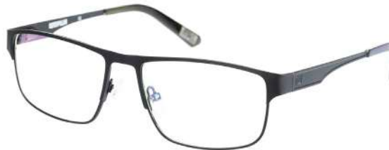
CTO-BILLET-003 Rubberized matte black