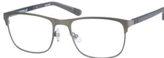
CTO-PADSTONE-005 Matte gray