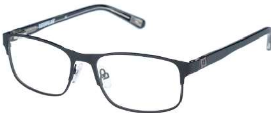
CTO-CONTRACTOR-004 Matte black