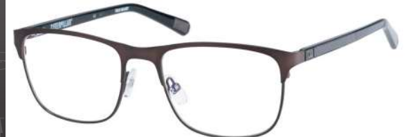
CTO-PADSTONE-010 Matte dark gun