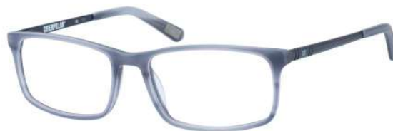
CTO-SCHEDULER-106 Matte blue