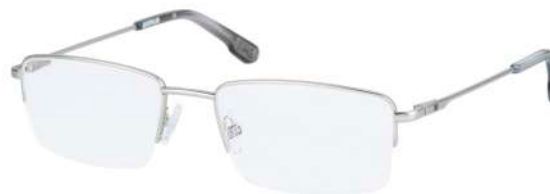
CTO-TINKER-002 Matte silver