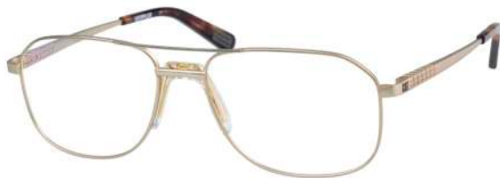
CTO-ZONER-001 Matte gold