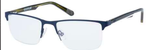
CTO-GAMBREL-006 Matte navy