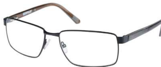
CTO-RIVETER-004 Rubberized matte black