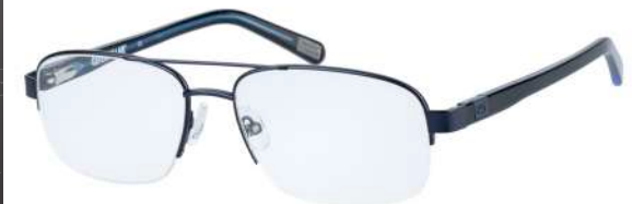
CTO-GLAZER-006 Matte navy