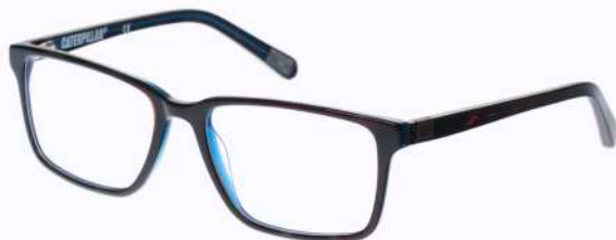
CTO-CHUCK-118 Gloss brown / Blue