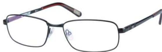
CTO-SETTER-004 Matte black