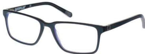
CTO-CHUCK-127 Gloss blue horn