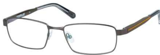
CTO-NEEDLE-005 Matte rubberized gun