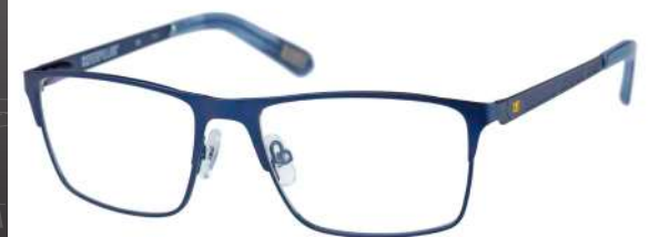
CTO-FITTER-006 Rubberized matte navy