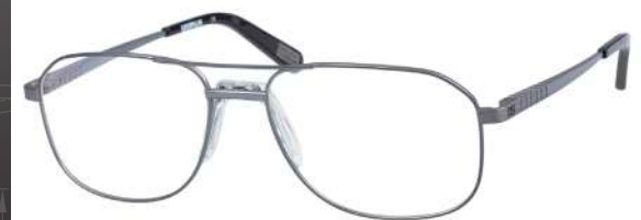
CTO-ZONER-005 Matte gun