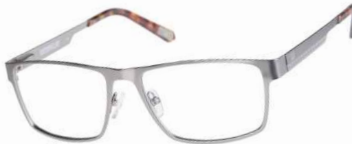
CTO-TWINTHREAD-005 Matte gun