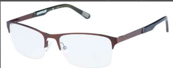
CTO-ESTIMATOR-010 Shiny gun / Solid smoke