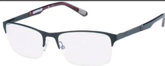
CTO-ESTIMATOR-004 Matte brown / Solid green