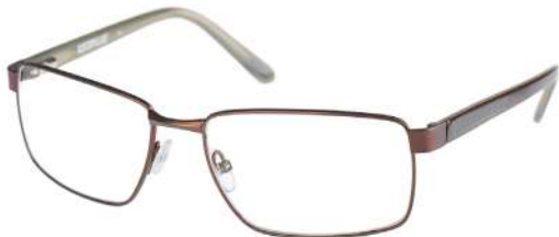
CTO-RIVETER-003 Rubberized matte brown