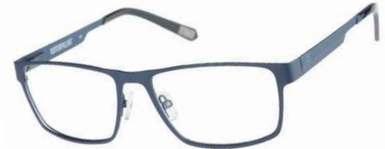
CTO-TWINTHREAD-006 Rubberized matte navy