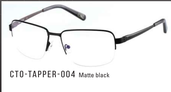
CTO-TAPPER-004 Matte black