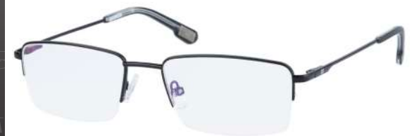
CTO-TINKER-004 Matte black