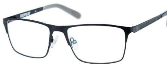
CTO-FITTER-004 Matte black