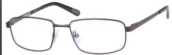
CTO-DENTILS-010 Matte dark brown