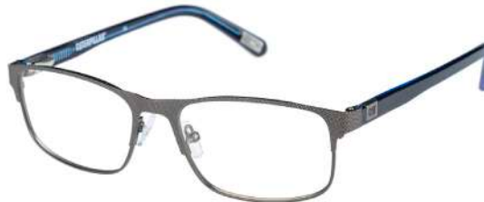
CTO-CONTRACTOR-005 Matte gun