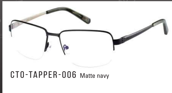
CTO-TAPPER-006 Matte navy