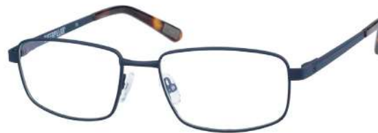
CTO-DENTILS-006 Matte rubberized navy