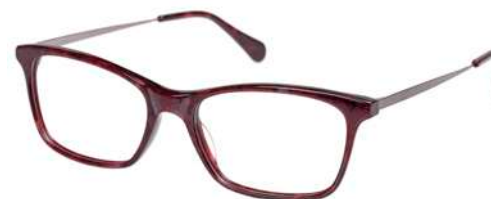
ESME - 162