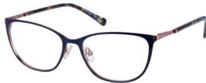
ALI - 261