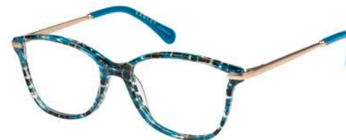
VANESSA - 188