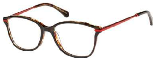
VANESSA - 102