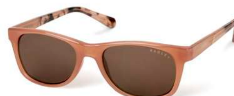
FIA - 172