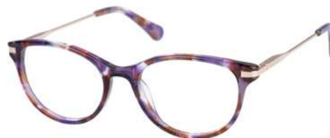
MARCIE - 161 Gloss purple tort / Gold