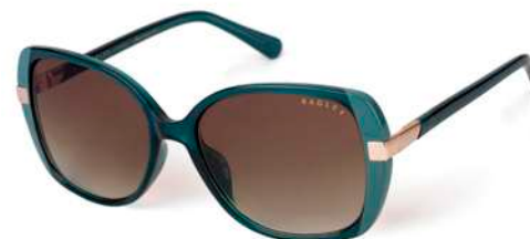
MORWENNA - 107

Gloss solid black / Shiny gold Smoke grad