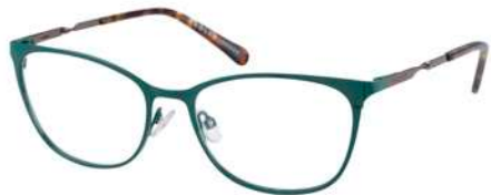
JANUARY - 207