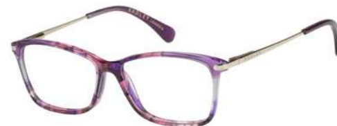
KEZIA - 161