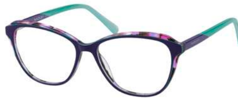
KADY - 161