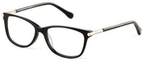
ROBYN - 104 Gloss Black / Matte Gold