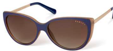
GENNA - 106

Gloss black / Tort - Rose gold Smoke grad