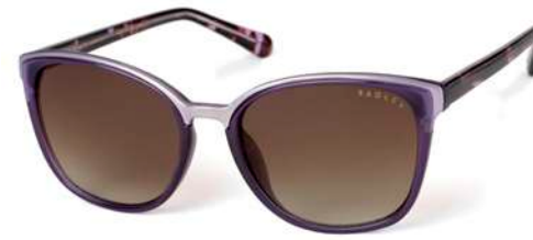
OTTOLINE - 161

Gloss black / Pink tort - Rose gold Smoke grad