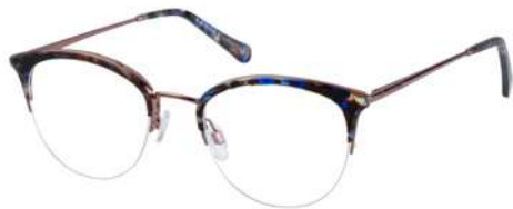
DANIA - 105