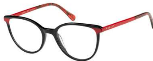
KAROLINA - 104