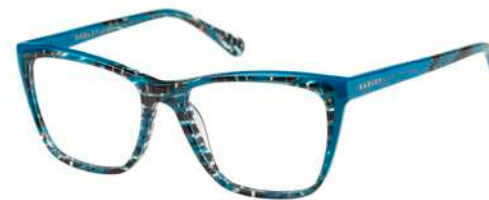
JANELLA - 103