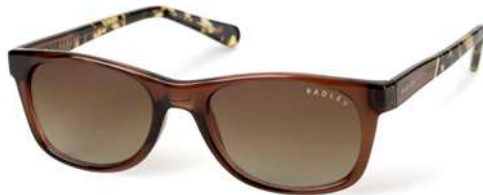
FIA - 103