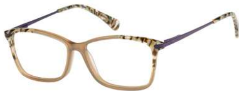
KEZIA - 103