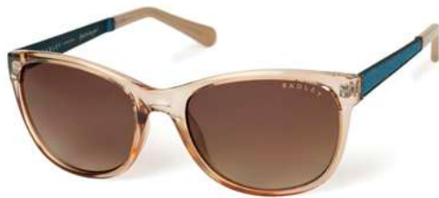
SASHA - 103

Gloss camel / Teal - Shiny gold Brown grad