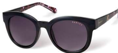
ELSPETH - 104