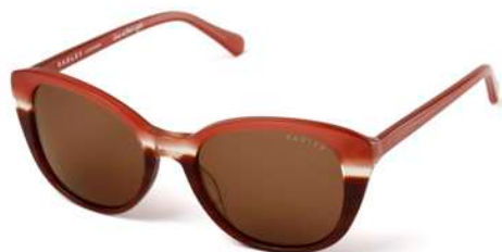
ANNA - 150