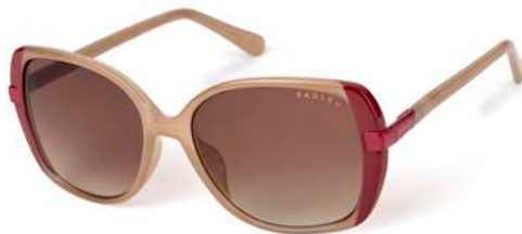
MORWENNA - 103

Gloss camel / Burgundy - Shiny gold Brown grad