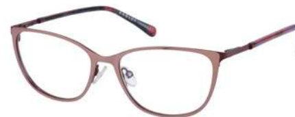
ALI - 272

Shiny rose gold / Sangria / Burgundy tort