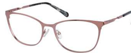
JANUARY - 272