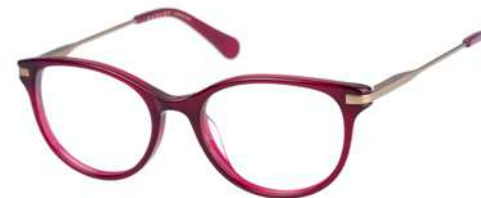
MARCIE - 162 Burgundy crystal / Rose gold