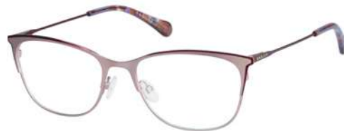
YOLANDE - 061 Matte rose gold / Purple