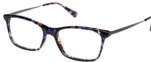
ESME - 105