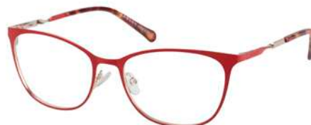
JANUARY - 260