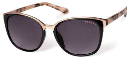
OTTOLINE - 104

Gloss black / Pink tort - Rose gold Smoke grad