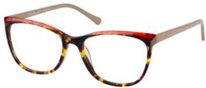
PORTIA - 102