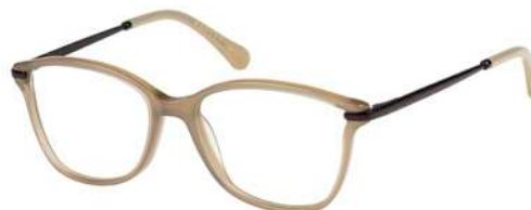
VANESSA - 103