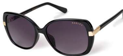
MORWENNA - 104

Gloss camel / Burgundy - Shiny gold Brown grad