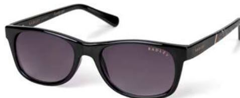
FIA - 104