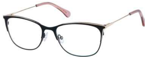
YOLANDE - 004 Matte black / Shiny gold