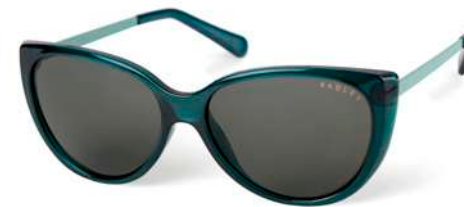
GENNA - 107

Gloss navy / Brown crystal - Shiny gold Brown grad