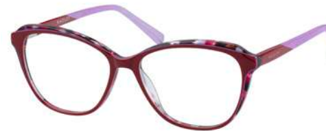
KADY - 162