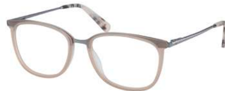
CALICO - 108