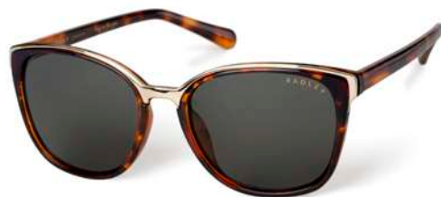
OTTOLINE - 102