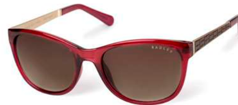
SASHA - 162

Gloss turquoise crystal / Grey - Shiny silver Solid smoke