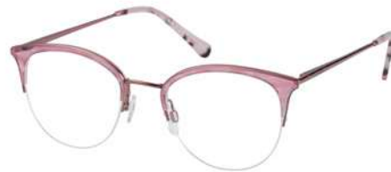
DANIA - 172

Shiny rose gold / Gloss rose horn / Gloss pink tort