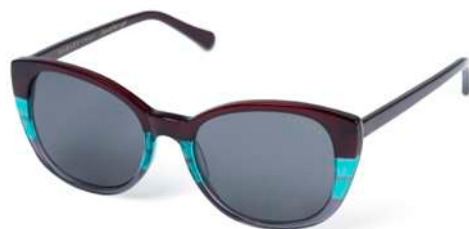
ANNA - 162

Gloss Burgundy / Grey / Green Solid smoke