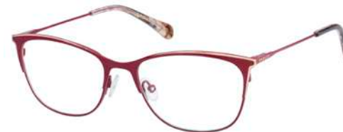
YOLANDE - 062 Matte Burgundy / Matte gold