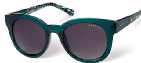
ELSPETH - 107