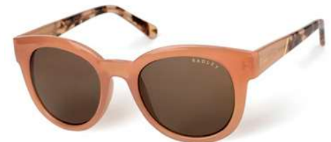
ELSPETH - 172