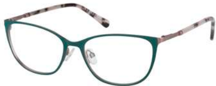
ALI - 207