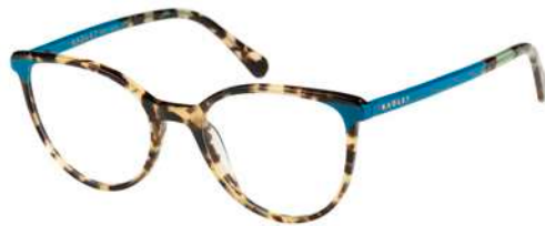
KAROLINA - 102