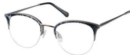
DANIA - 195

Shiny rose gold / Gloss rose horn / Gloss pink tort