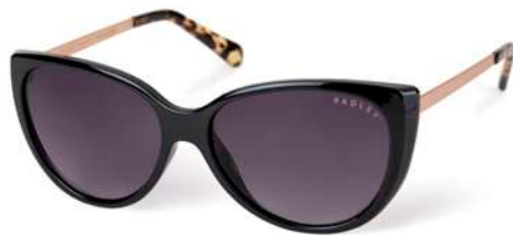
GENNA - 104

Gloss black / Tort - Rose gold Smoke grad