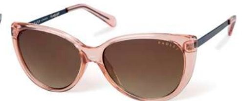
GENNA - 172

Gloss green crystal / Matte gray Solid green