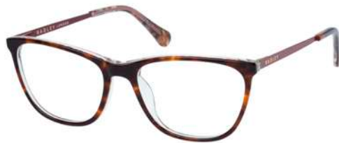
MARGARET - 102