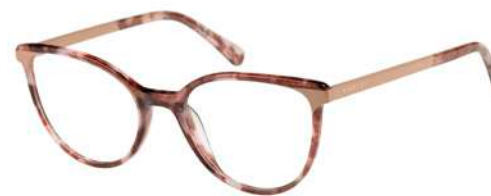
KAROLINA - 172