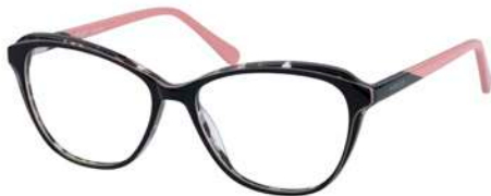
KADY - 104