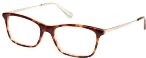
ESME - 102