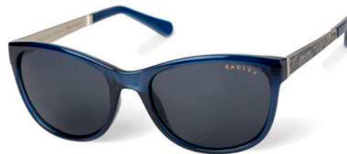
SASHA - 107

Gloss camel / Teal - Shiny gold Brown grad