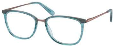
CALICO - 107