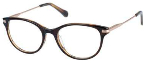
MARCIE - 102 Gloss brown horn / Gold