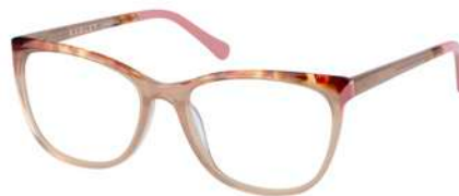
PORTIA - 118