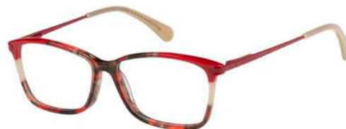
KEZIA - 160