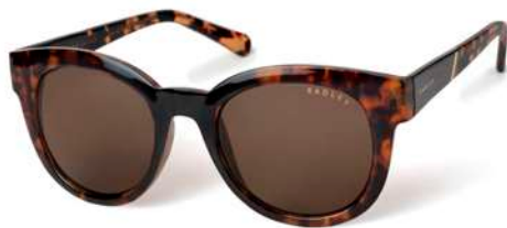
ELSPETH - 102