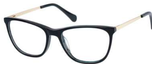
MARGARET - 104