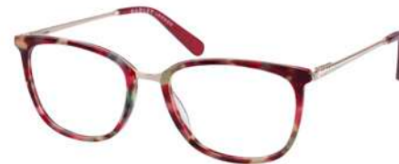
CALICO - 162