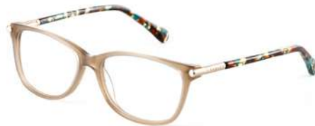
ROBYN - 107 Gloss Nude / Teal Floral Tort / Gold