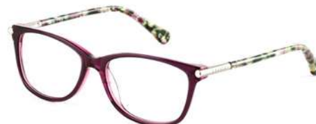
ROBYN - 161 Gloss Purple / Lilac floral / Satin Silver