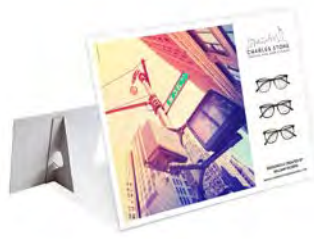
A5 STREET SIGN STRUT SHOWCARD