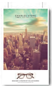
STATIC NEW YORK SKYLINE WINDOW BANNER