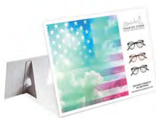
A5 FADED FLAG STRUT SHOWCARD