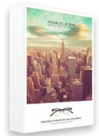
A4 NEW YORK SKYLINE DISPLAY BOX SHOWCARD